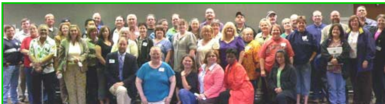
Progressive Dues Structure Chapter Leaders of ASEA/AFSCME Local 52

400 Willoughby, Ste 201 Juneau AK 99801 463-4949 or 800-478-0049