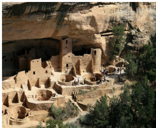
Mesa Verde National Park Colorado