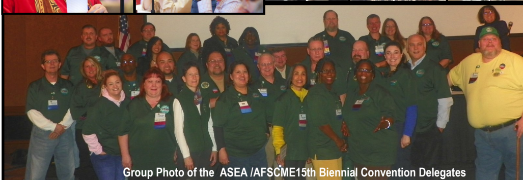
Group Photo of the ASEA /AFSCME 15th Biennial Convention Delegates