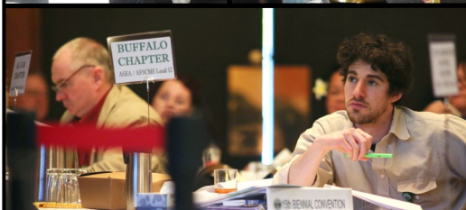
Delegates at Convention in Session