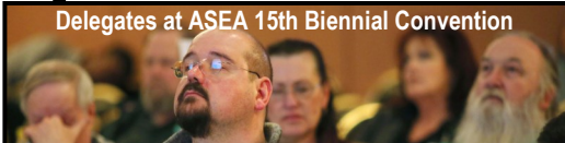
Delegates at ASEA 15th Biennial Convention