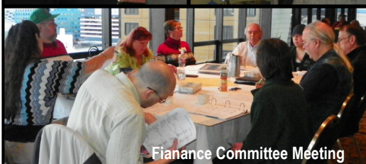
Finance Committee Meeting