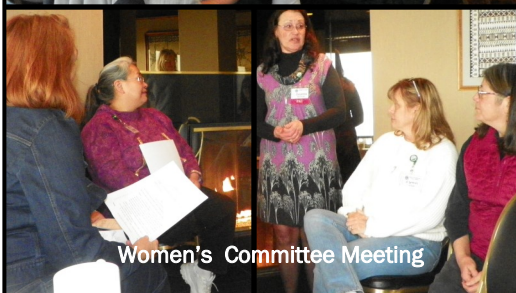
Women's Committee Meeting