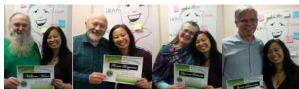
Midnight Sun Chapter (to the left)